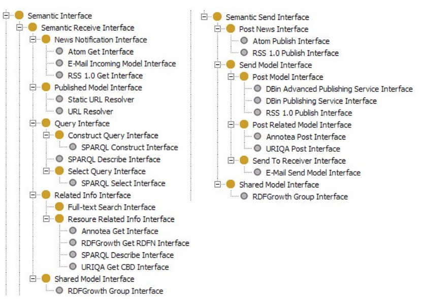
Figure 2: The SemanticInterface hierarchy and built in interfaces instances.

The UML diagram in Figure 1 shows the main classes in DODA and their relationships. A DODATechnology (e.g. a POPM) can expose one or more interfaces, expressed as instances of the SemanticInterface class hierarchy. Figure 2shows the SemanticInterface hierarchy together with premodelled instances (smaller dots). Such instances are connected by providesInterface properties, to the appropriate instances of DODATechnologies (e.g. The doda:RSSNewsFeedTechnology ).